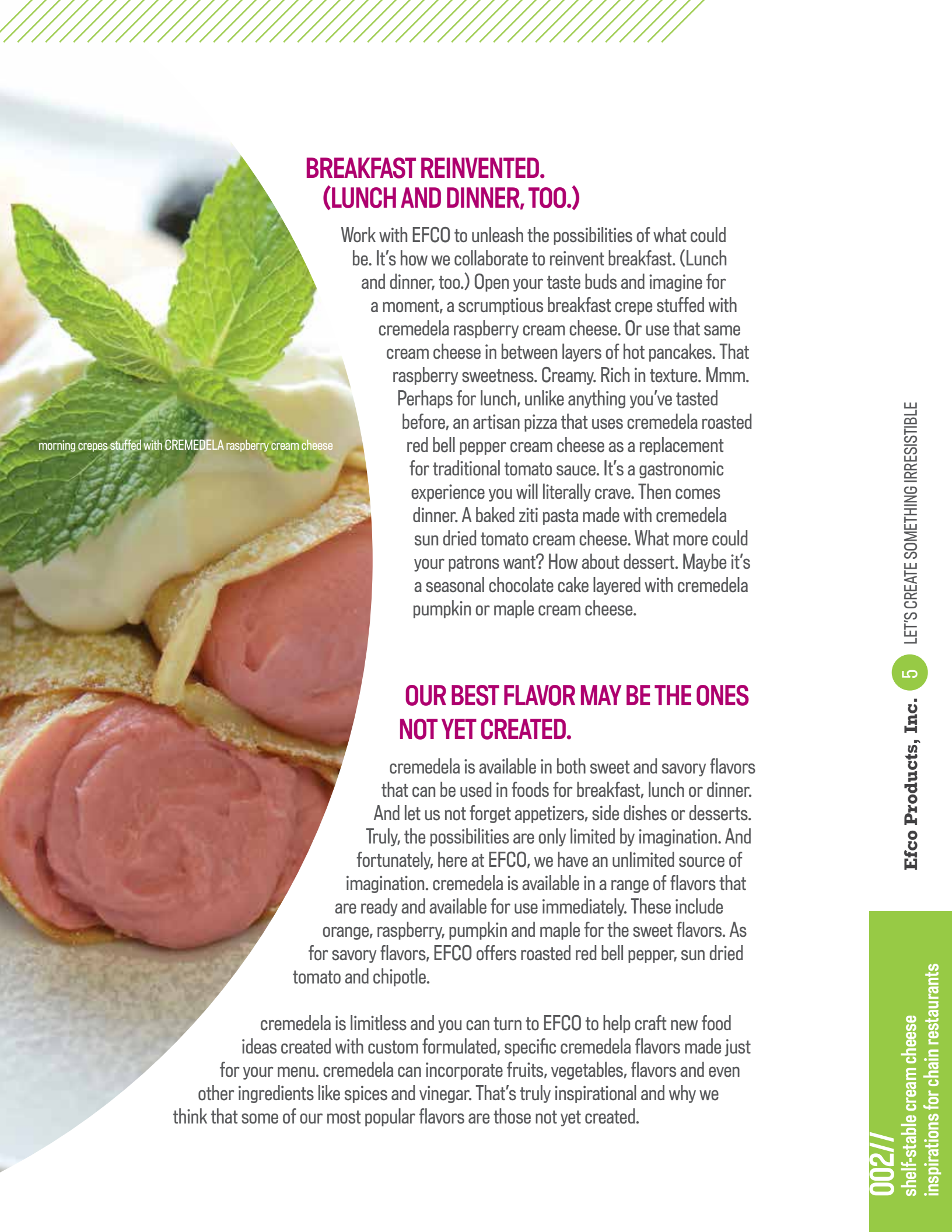
morning crepes stuffed with CREMEDELA raspberry cream cheese