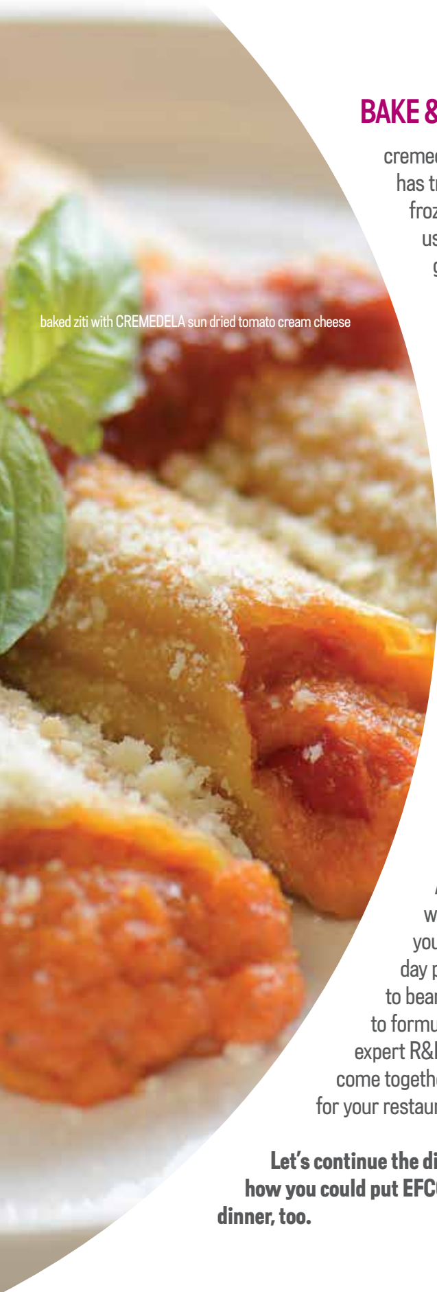
baked ziti with CREMEDELA sun dried tomato cream cheese